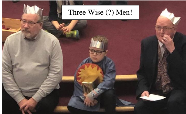
Three Wise (?) Men!