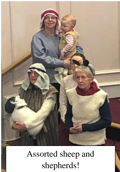
Assorted sheep and shepherds!

What better message to end 2019 with (and take with us into 2020!) but the wonderful story of the nativity..... with a twist.