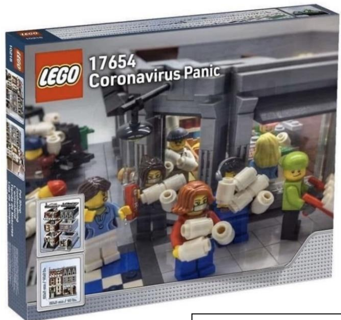
Christmas Lego 2020